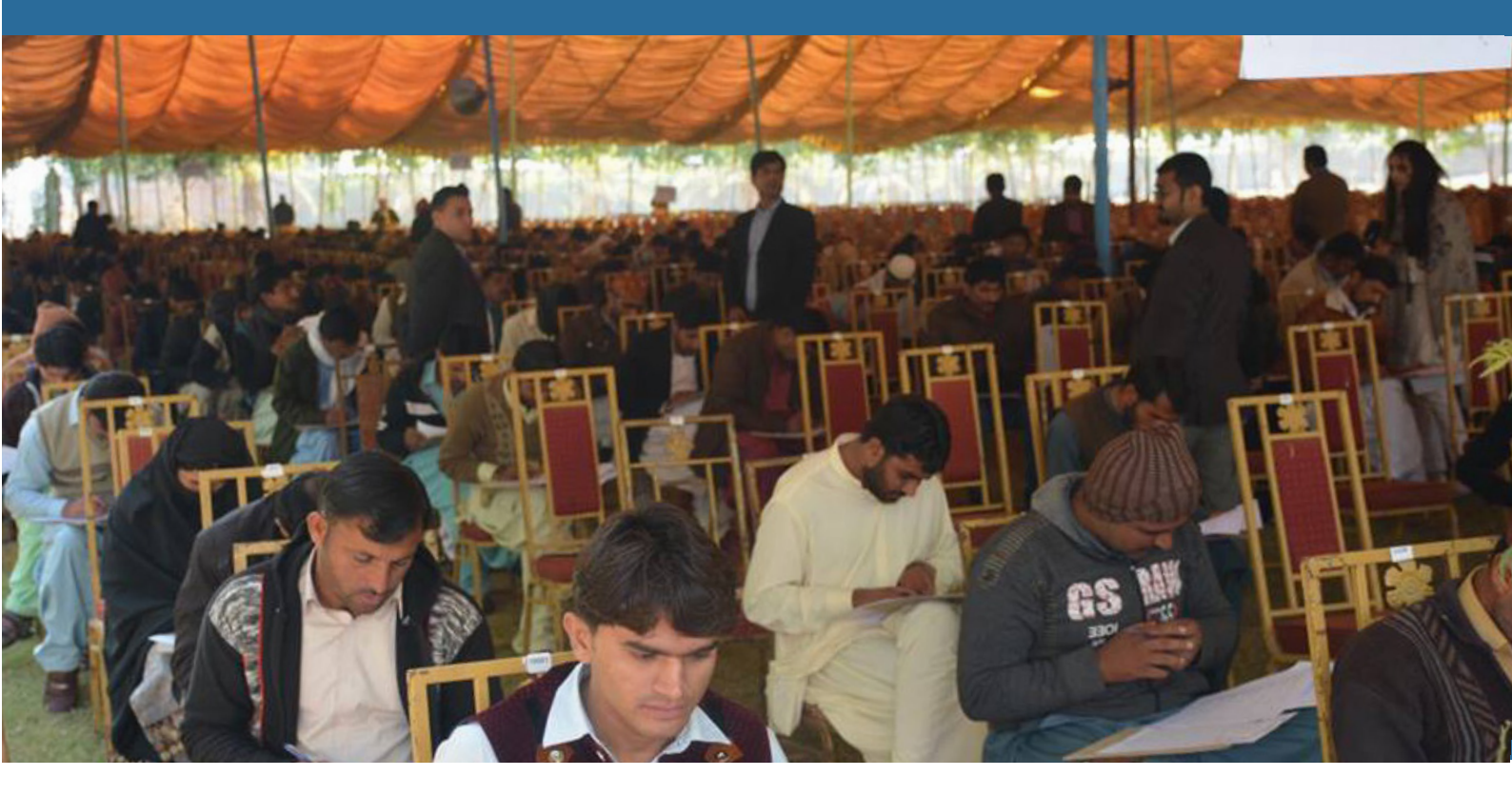
Sukkur IBA testing Services (STS) conducted admission test for Directorate of Nursing

Recruitment test of various positions for Sindh Rural Support Organization (SRSO) was conducted by SIBA Testing Services at Sukkur IBA University. About 400 candidates all over Pakistan participated in the test. The candidates highly appreciated the merit, quality and excellence based services of Sukkur IBA Testing Services.