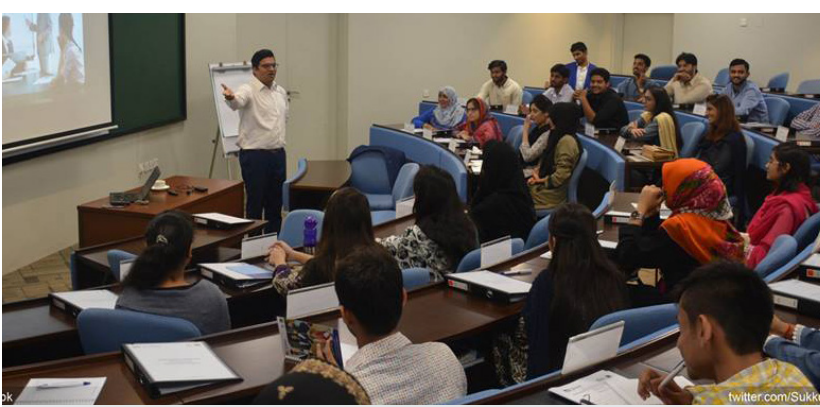
USAID Training Workshop on Talent Grooming

A three-day USAID training workshop on talent grooming and career counseling for scholars under USAID-funded Merit and Need-Based Scholarship Program (Phase II) held at Sukkur IBA University.